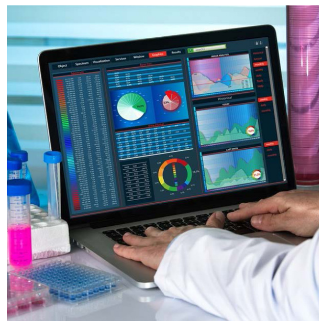
Module 3: Analyses