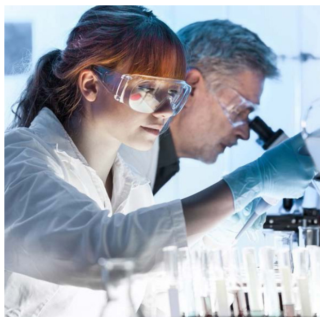
Module 1: The Health of Women and Men

A how-to on considering SABV in all stages of the biomedical research spectrum